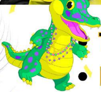
Table Decorating Contest