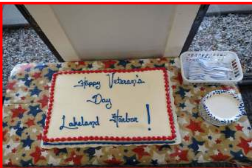
Cake Provided by Management.