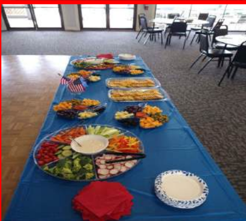
Appetizers for Veterans and their family/guest.

The Missing Man Table, which is sometimes referred to as the Fallen Comrade Table, is meant to remind viewers of those fallen, missing, or imprisoned United States military service members.