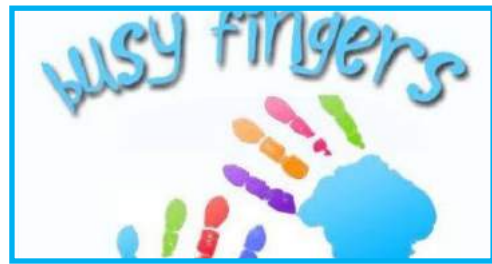
The ladies who make so many interesting and wonderful crafts celebrated in April with their annual luncheon.