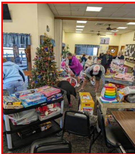
Packing up what's under the tree