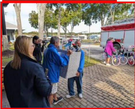
Carrying the donation box to the firetruck, only the first trip with gifts