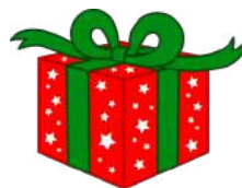
Everyone had such a great time