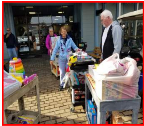
More to add to the transport to the kids