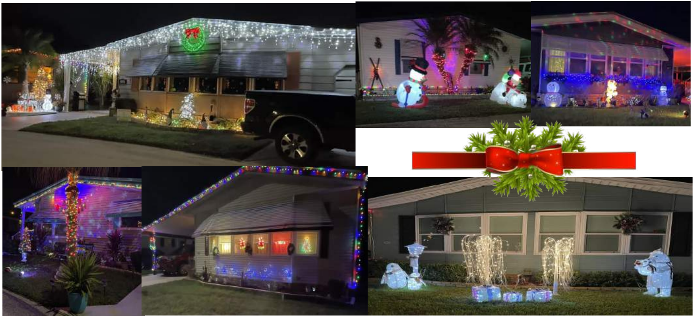
JUST A FEW OF THE RESIDENT'S HOMES WITH HOLIDAY DECORATIONS JUST IN CASE YOU MISSED IT!

LAKELAND HARBOR IS VERY FORTUNATE TO HAVE OUR GREAT RESIDENTS THAT COME TOGETHER TO CELEBRATE THE HOLIDAYS