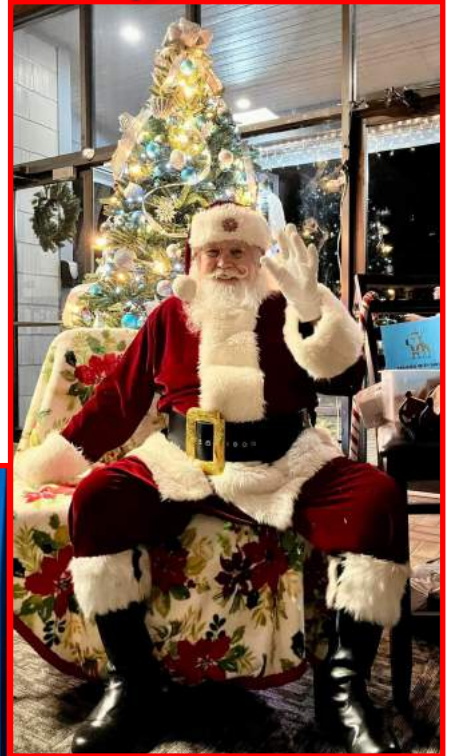
Wouldn't be a Christmas Party without our resident Santa Claus