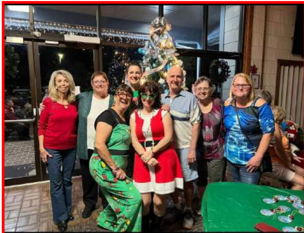
A few of our party guests