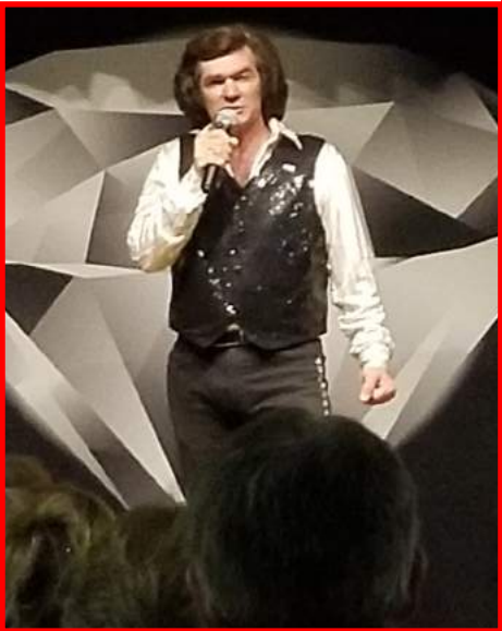
Out serenading the audience